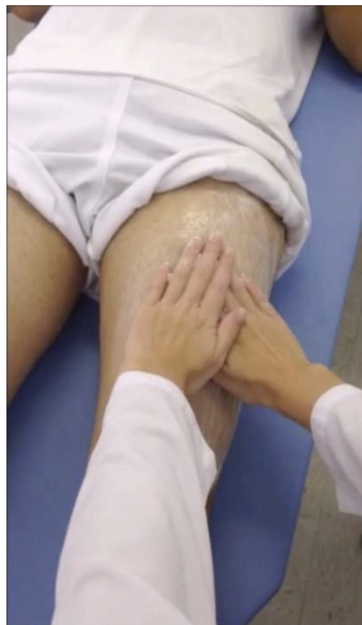
Massage therapy techniques.